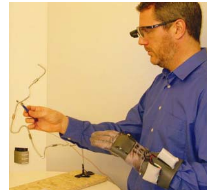
figure 2: A person using the HotWire setup

A person using the apparatus is shown in figure 2. The matching tasks are presented in an SV-6 monocular HMD from MicroOptical with 640x480 pixels resolution and 18 bits color depth. Being non-transparent and relatively small, the HMD can be positioned so that it does not obscure the user's regular field of view, while remaining easily accessible via glances of the eye.