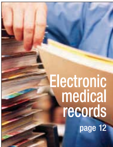
Electronic medical records page 12