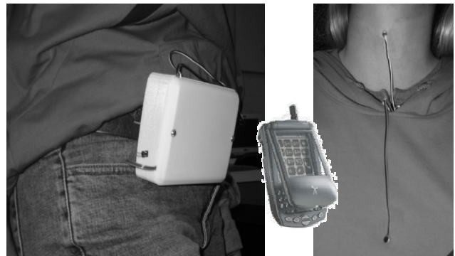
Figure 1. SenSay: sensor box mounted on the hip (left), the mobile phone (center), and voice and ambient microphones mounted on the user (right).

In a much more limited context the idea of smart appliances and phones was explored in [1], [3], [4] and [5]. In [2] concepts of context-aware computing and wearable devices have been described.