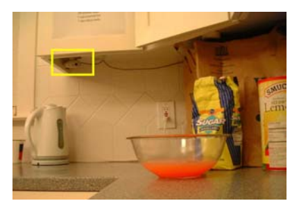
Figure 1. Kitchen setup at (a) eye-level view (b) close-up underneath view of cameras