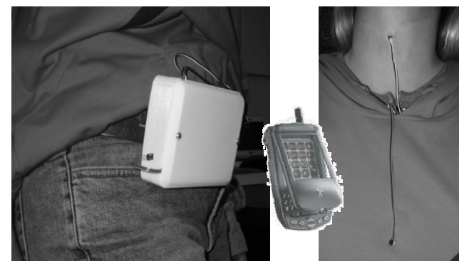
Figure 1. SenSay: sensor box mounted on the hip (left), the mobile phone (center), and voice and ambient microphones mounted on the user (right).

In a much more limited context the idea of smart appliances and phones was explored in [1], [3], [4] and [5]. In [2] concepts of context-aware computing and wearable devices have been described.