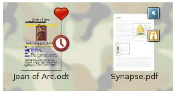
Figure 2 Two documents with smart icons

The interest of smart icons is to convey to the user as much as possible information about the objects they represent, in a clear and non-intrusive way.