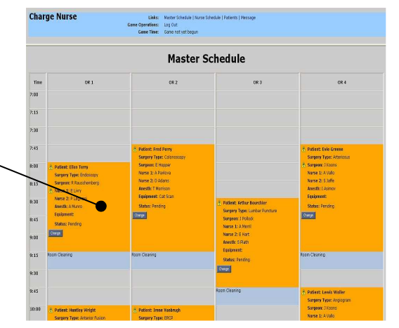
figure 1. The master schedule

Each surgery includes a surgeon, two nurses, an anaesthesiologist, and equipment. Yellow warning icons indicate a scheduling problem with one of these resources.