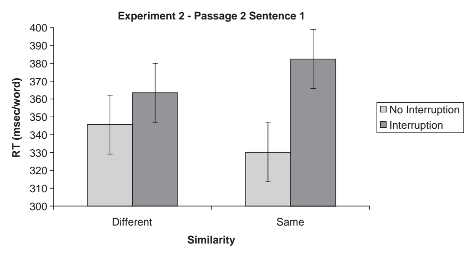
Figure 2. Mean reading time per word (ms) for similar and dissimilar secondary passages in both continuous and interleaved presentation forms in Experiment 2.

both continuous and interleaved presentation forms in Experiment 2 is presented in Table 7. Participants were more accurate at answering the first comprehension question after reading passages in the continuous condition relative to the interleaved condition, F_I(1, 63) = 6.86 , p = .011, F_2(1, 19) = 9.05 , p = .007. There was no significant effect of similarity on first-question accuracy, F_I and F_2 < 1 . No interactions of the experimental factors were significant. There was no significant difference in participants' ability to answer the second comprehension question based on experimental condition.