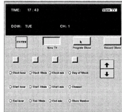
Figure 1: The VCR Interface

The experiment was a 3 x 3 mixed factorial design with interruption difficulty as a between subjects factor with three levels (Shadowing, 1-back, and 3-back) and sessions as a within subjects factor with three levels (1, 2, and 3). Participants were trained on the VCR task individually and then the VCR task with either the shadowing, 1-back, or 3-back interruption depending on what condition they were in. Participants then completed three sessions, with each session consisting of three